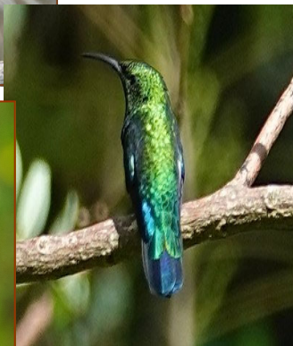
Green Throated Carib