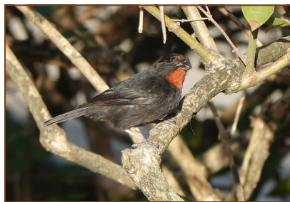
Lesser Antillean Bullfinch

This will be the first time a Care-free Birding cruise goes to Dominica and Tobago, and we're never exactly sure what will be seen. They've said that the 'new' species that we're hoping we'll find